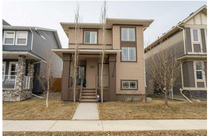
14 Ravenskirk Ct SE, Airdrie, AB

Main Floor Exterior Area 714.82 sq ft Interior Area 650.27 sq ft