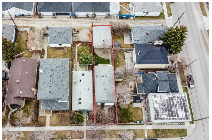
908 5 St NW, Calgary, AB

Main Floor Exterior Area 743.55 sq ft Interior Area 703.84 sq ft