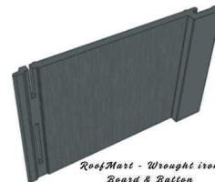
RoofMart - Wrought iron Board & Balton