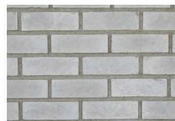
Selkirk - Contemporary Brick Bisque