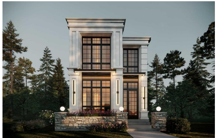
1623 21 Avenue NW (West)

Discover luxury and functionality in this spacious detached infill, nestled in the desirable community of Capitol Hill. Built by the award-winning ACE HOMES, this home sits on an impressive 27.5-foot WIDE LOT, offering over 3,000 SQFT of developed space that combines contemporary design with thoughtful details. With a total of 5 BEDROOMS, this home is ideal for families, multi-generational living, or those looking for rental potential. The layout includes 3 bedrooms upstairs and a 2-bedroom LEGAL BASEMENT SUITE with its own entrance. The main floor is designed for both elegance and convenience, featuring a dedicated dining room, a POCKET OFFICE, a walk-in BUTLERS PANTRY with a prep sink and beverage fridge, and a SOUTH-FACING LIVING ROOM that fills the space with natural light. A spacious mudroom and powder room add to the home's functionality. Upstairs, you'll find a large primary suite with a VAULTED CEILING, a custom COFFEE BAR, and a 5-piece ensuite with upscale finishings. Two additional bedrooms, each with tray ceiling details and their own 3-PIECE ENSUITE, provide a perfect balance of privacy and comfort for family members or guests. The legal basement suite, with separate mechanical room access, is fully equipped with a modern kitchen, including a fridge, dishwasher, OTR microwave, and range, along with IN-SUITE LAUNDRY. The basement's two bedrooms share a full