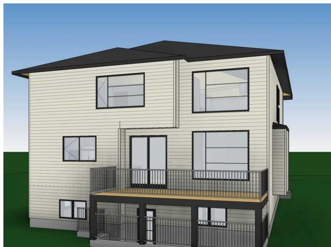
24 N Bridges Glen, Langdon, AB