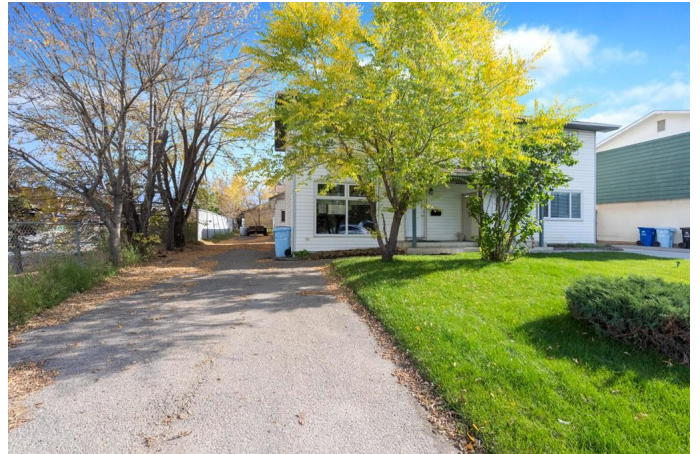
1 Pond Crescent, Fort McMurray, AB

1 Pond Cres has lots of upgrades to it. It's a perfect starter home for a growing family. The location is good close to shopping, trails, buses, hospital and grocery stores. This home is move in ready. Both bathrooms have been renovated. The basement has been upgraded. There is tons of parking, the garage is as is. So many great and amazing features in this three bedroom fully developed home. New roof, furnace, hot water tank and electrical panel. Inclusions: fridge, stove, microwave, washer, dryer and window coverings. It's ready for its new owners! Watch the video tour and 360 tour to get a better look at this property.