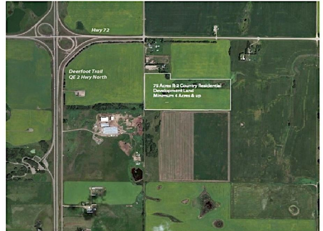
Subject Property 75.07 Acres

75 Acres in MD of Rockyview, a Great INVESTMENT Opportunity, the perfect place to build your dream home, Minutes from Booming Airdrie, Balzac Mega Mall, and 15 minutes from Calgary City Limits. It is Currently Zoned R-RUR / A-SML. With county approval, you may be able to subdivide into 9-15 Parcels. A minimum of 4-acre parcels each and one 13-acre parcel for your dream home. This Beautiful parcel of rolling land offers unobstructed Mountains, partial Calgary views, and a pond. This location has easy access just off Hwy QE2 easy. Minutes from the Cross Iron Mills Shopping Centre in Balzac. Already Zoned for R-RUR / A-SML. The land could be rented to a local farmer. for $95 per acre. Don't Miss this Opportunity!!!!