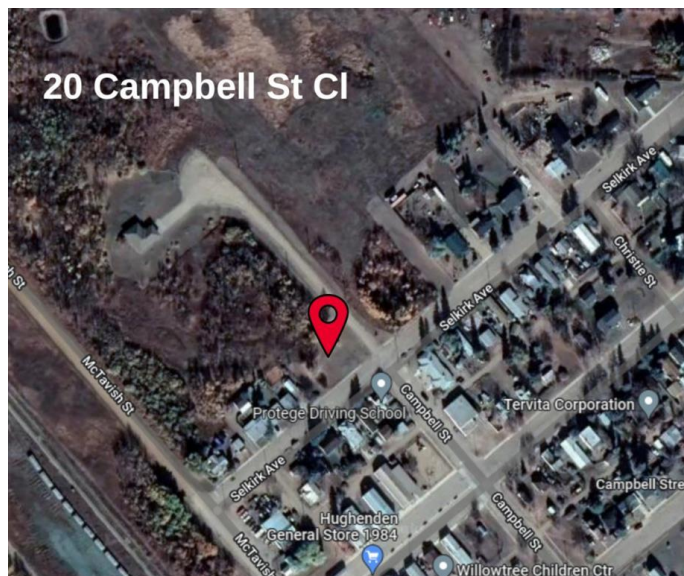
20 Campbell St Cl